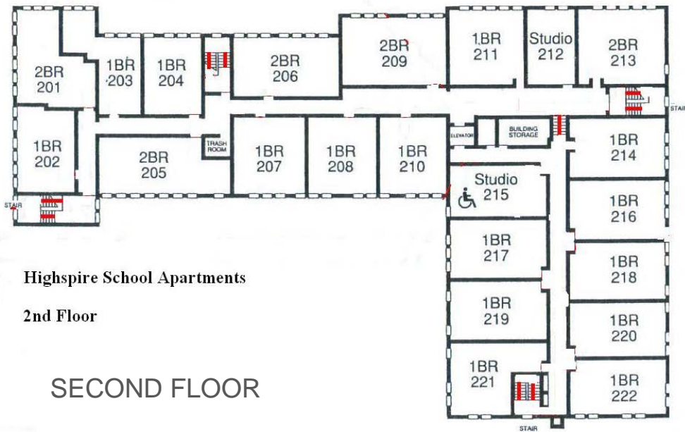
Highspire School Apartments 2nd Floor