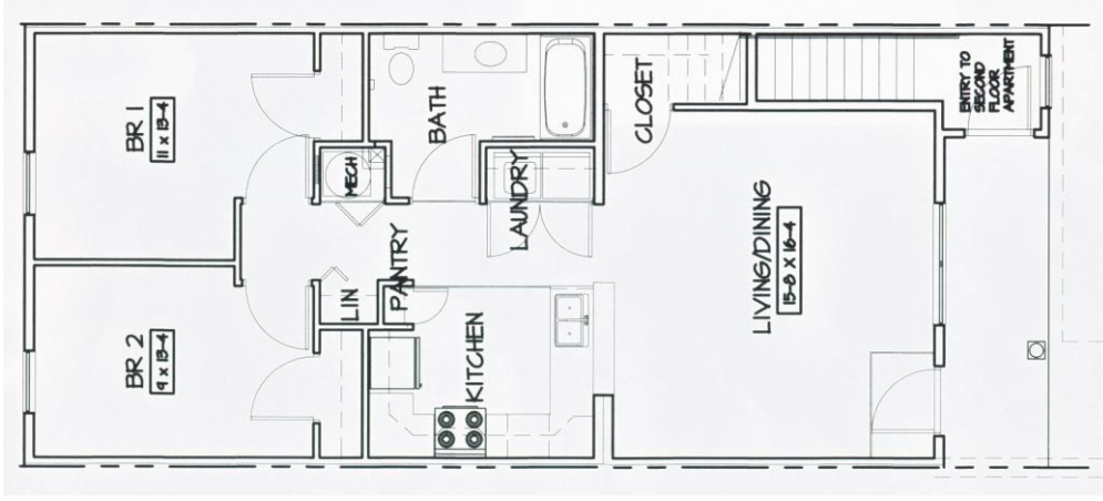
Two Bedroom Unit Layout